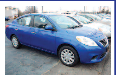
2012 Nissan Versa