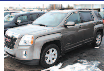
2010 GMC Terrain