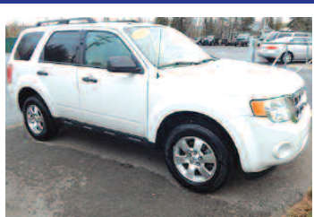
2010 Ford Escape