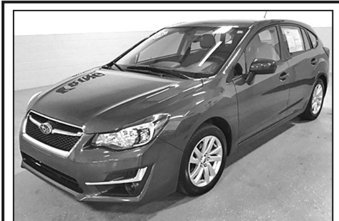
2015 SUBARU IMPREZA 2.0i Premium

Whatever you do, work at it with all your heart, as working for the Lord, not for human masters, since you know that you will receive an inheritance from the Lord as a reward. It is the Lord Christ you are serving. Colossians 3:23-24 NIV