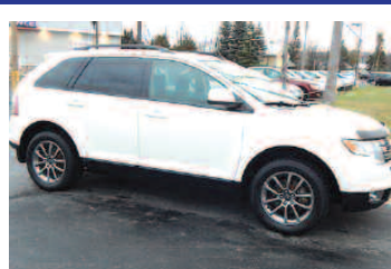
2008 Ford Edge