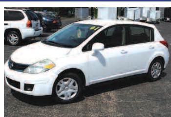
2010 Nissan Versa