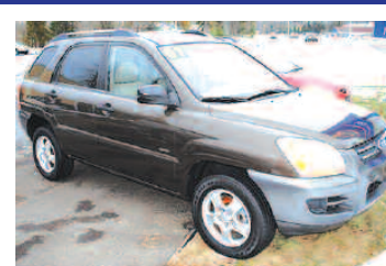
2007 Kia Sportage