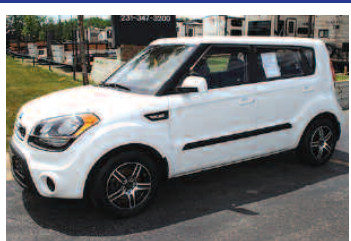
2013 Kia Soul