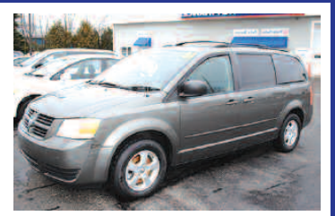
2010 Dodge Grand Caravan