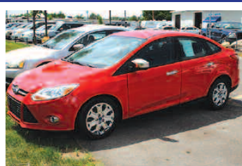
2012 Ford Focus SE