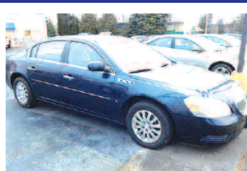
2008 Buick Lucerne